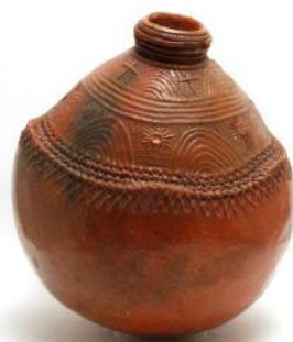
Large decorated pot (MAA, Cambridge)