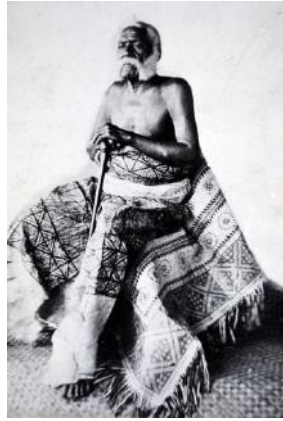
Ratu Epenisa Seru Cakobau paramount chief of Bau, c. 1873