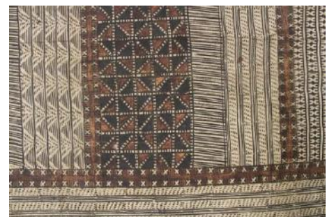
Above: Long decorated barkcloth sheet (detail), 1870s. Below: Barkcloth (detail), c1850-1859