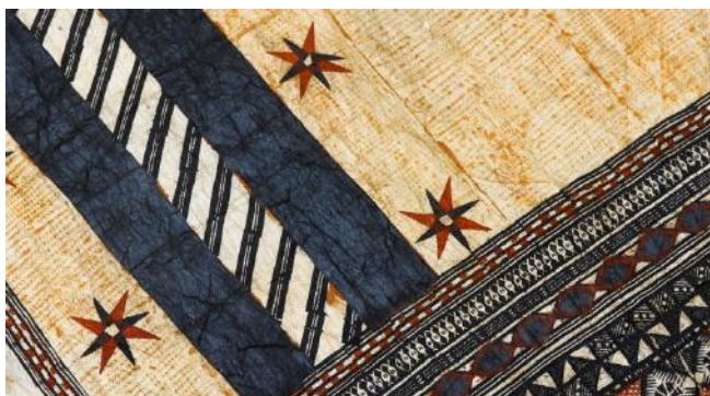
Painted & stencilled barkcloth, detail (Maidstone Museum & Bently Art Gallery)