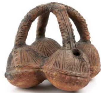
Water vessel ( saqa moli ), mid-19 th century Low fired earthenware (Sainsbury Centre for Visual Arts, UEA)