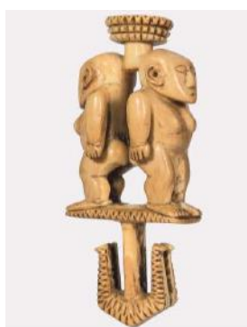
Whale ivory double-figure hook (University of Aberdeen Museums)