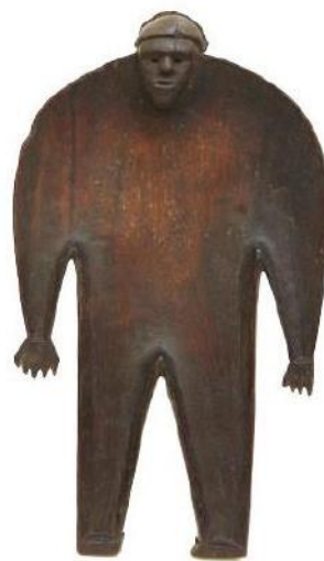
Man-shaped dish for yaqona (kava)