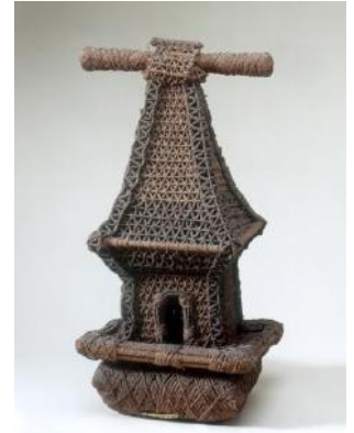
Model temple, coir basketry & wood (MAA, Cambridge)