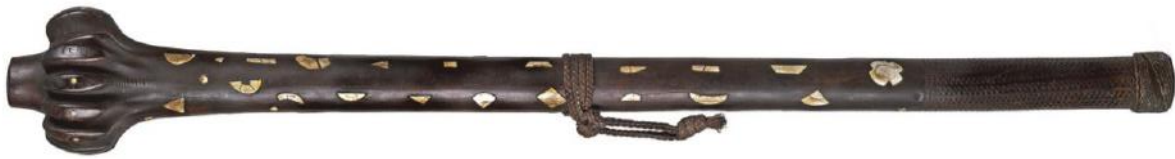
Royal club, inlaid with whale ivory, presented by Ratu Cakobau, paramount chief of Bau, to Governor Sir Arthur Gordon, c. 1875-76 (Private Collection)