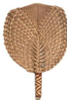
Plaited coconut leaf fan, with hibiscus cord (Museum of Archaeology & Anthropology, University of Cambridge)