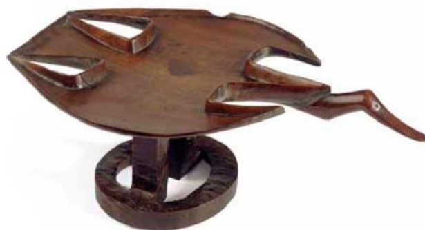
Priest's dish for yaqona (kava) in duck form with pedestal stand (Sainsbury Collection, SCVA)