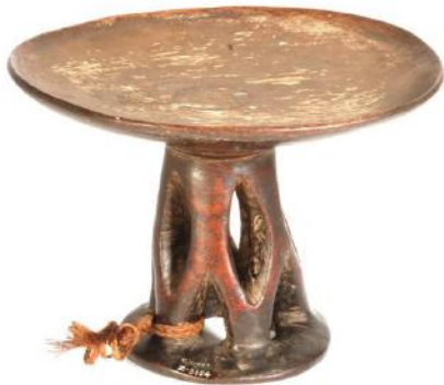
Pedestal dish used by priests for drinking yaqona (kava) (MAA, Cambridge)