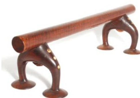
Wood headrest with whale ivory inlay (Museum of Archaeology & Anthropology, University of Cambridge)