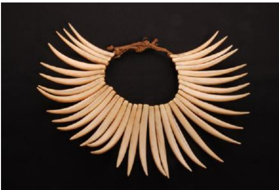
Whale ivory necklace (Museum of Archaeology & Anthropology, U. of Cambridge)