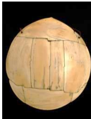
Breastplate, whale ivory & fibre (Trustees of Fiji Museum)