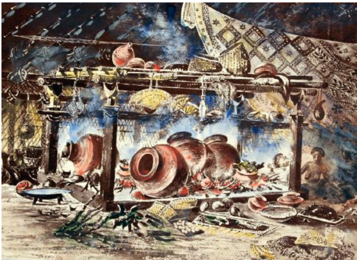
"The kitchen of a Fijian Chief. Fireplace in centre of the house. Earthenware pots made by hand. No wheel." Watercolour by Constance Gordon Cumming (Museum of Archaeology & Anthropology, University of Cambridge)