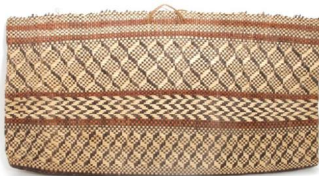
Plaited pandanus leaf and coir basket (Museum of Archaeology & Anthropology, University of Cambridge)