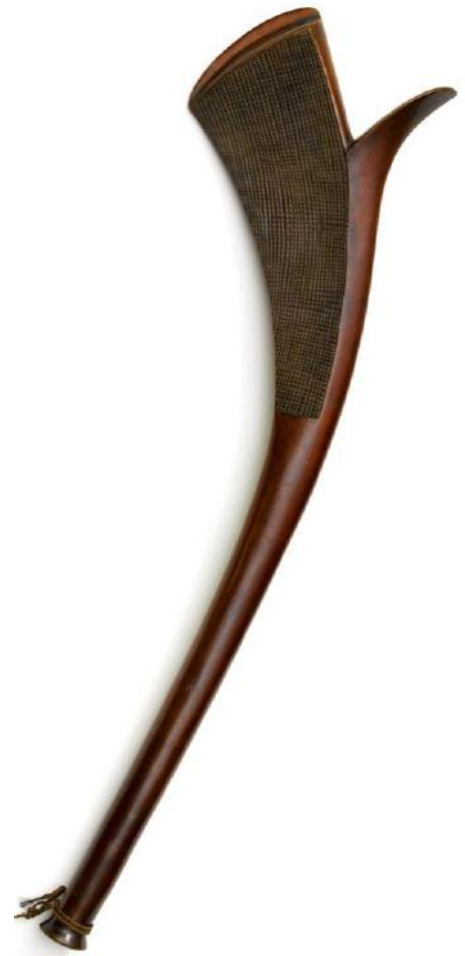
Club with flaring head form (Maidstone Museum & Bentlif Art Gallery)