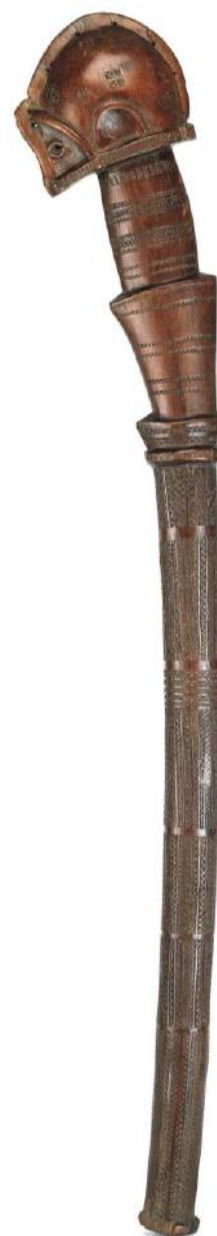
Right: Club in figural form