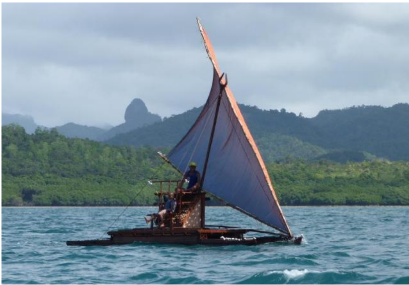
The specially-commissioned drua (sailing canoe) in Suva Harbour, 2015